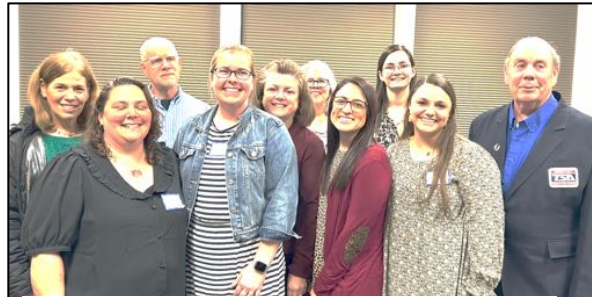
Killingly's Newest Grant Recipients