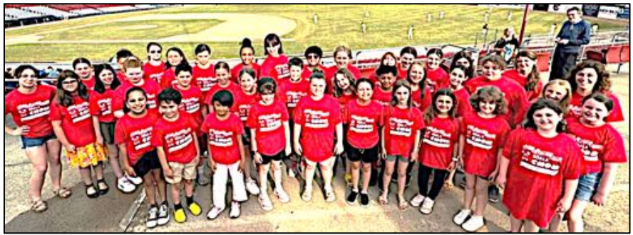
The Koala Choir outing in Spring 2024 to sing the National Anthem at a Norwich Sea Unicorns baseball game.