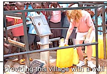
providing this village with a well

Notably, the group also carried out a major amazingly successful school-wide and community fundraising initiative to fund a bore-hole well in rural Uganda. The far-left photo above shows the large "Storyboard" the group created to foster awareness and action for the initiative. The funded